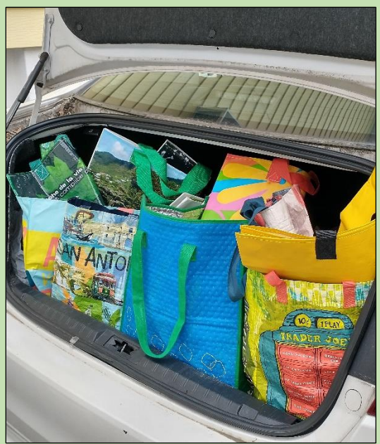
Reusable bags courtesy of Mindy Sears, Teaneck

May 4 is the day that single-use plastic bags and polystyrene foam food-service products will no longer be provided or sold in New Jersey. Click <a href="here">here</a> for details on the state Dept. of Environmental Protection website. Three MGs share their thoughts on the plastic bag.