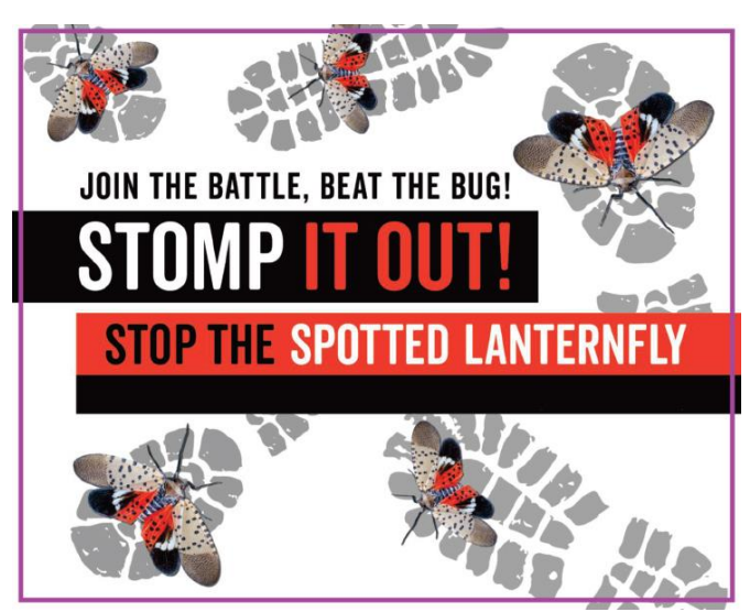
Image of the NJ Department of Agriculture scraper card being distributed through some Cooperative Extension offices.