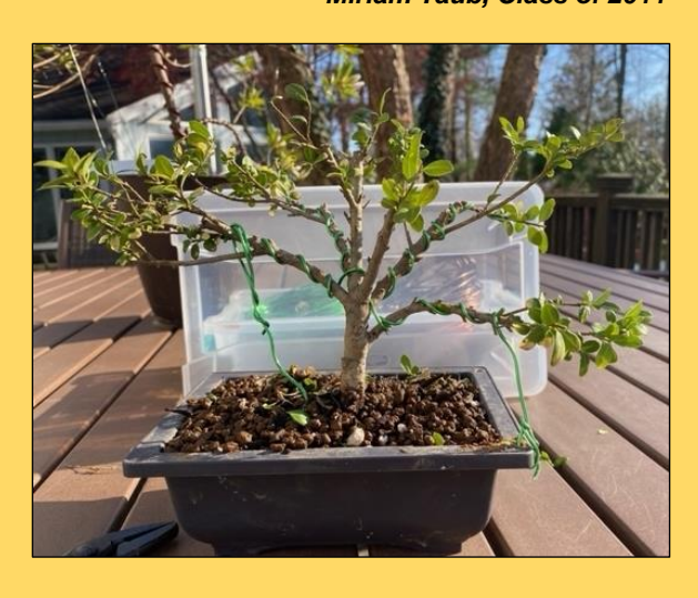
(Horticulture, continued on page 3)