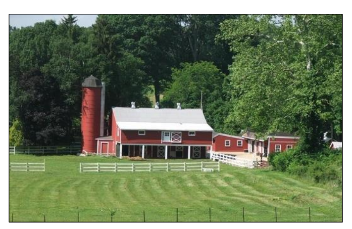
The old barn and the Sears Roebuck silo at Sun Valley Farm in Mahwah.