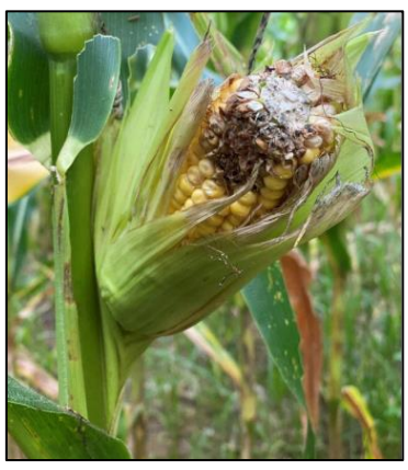
Direct deer damage to corn.