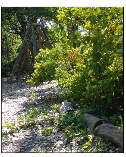
Help get rid of these weeds in the Peace Labyrinth.

MG volunteers: We need you Sept. 7 to weed in the Peace Labyrinth at Teaneck Creek Conservancy, 20 Puffin Way, Teaneck. Come any time from 9 am-1 pm to continue the cleanup that began in August. Earn volunteer hours and meet other MGs.