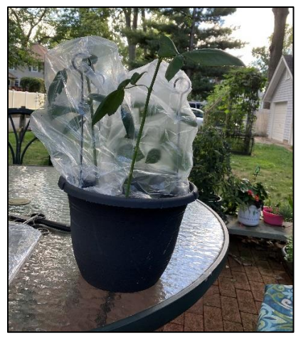
Rose cuttings in the mini greenhouse.

In 1971, when my husband and I moved into an apartment in a four-family house with a backyard, I asked my father if I could take the rosebush with me. He said OK without really understanding why. A few years later, my husband and I bought a house for our growing family and moved again. I took the rosebush with me.