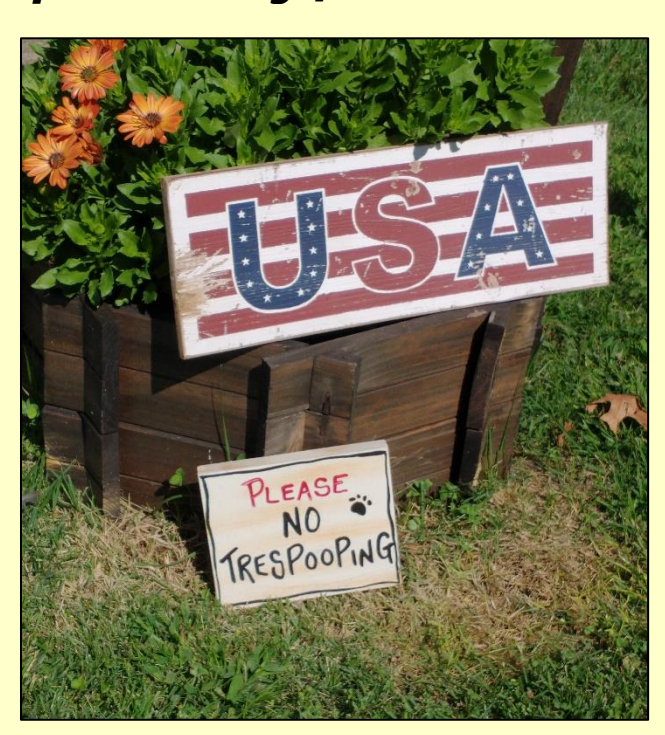
Have you seen any cute garden signs in your travels lately? Submit your photo to the <u>Potting Shed</u> in .jpg format. Let us know when and where you spotted your sign and include any commentary.