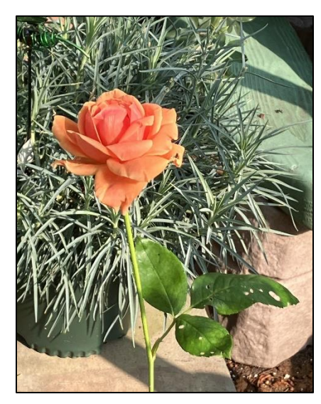
The first bloom on the new rosebush.

gathers around it, and the rewards of hard work. It represents the mysteries and the hopes in life. It's so beautiful to me.