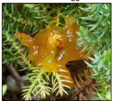
Oozing gall on a juniper in Melody's yard.

The resulting irritation and/or stimulation of the plant cells causes the plant to form hard, swollen growths around the insect eggs. These galls protect the eggs