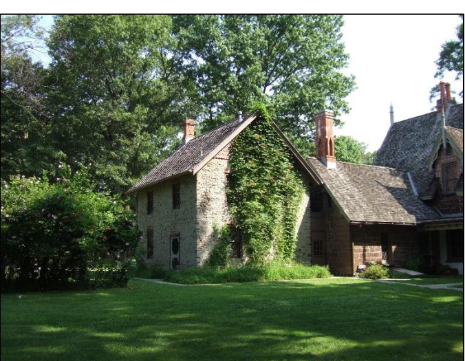
In July 2006, volunteers had quite a job removing this trumpet vine.