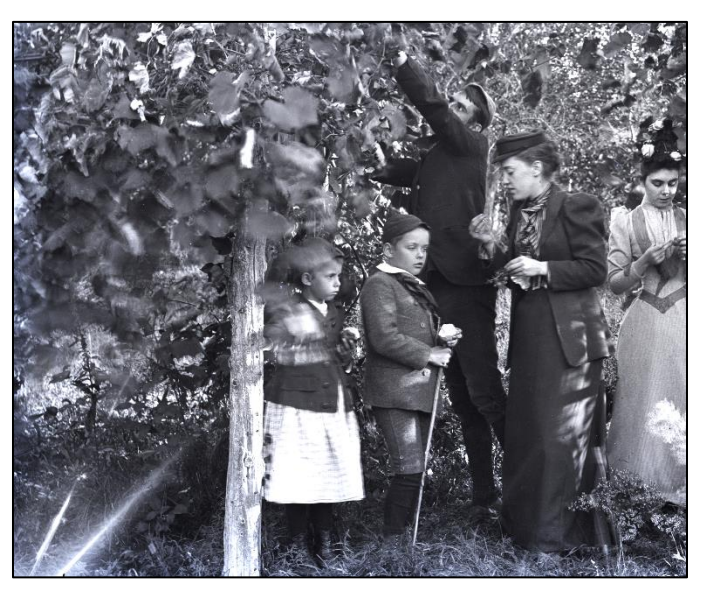
Rosencrantz Family Collection