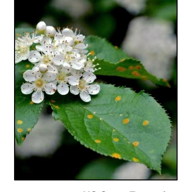
NC State Extension

for the legislative roster of state Senate and Assembly members. If you don't know your district, you can search by municipality. You can send an email directly to your state senators from the roster page should you want to express your opinion on the invasive species bill.