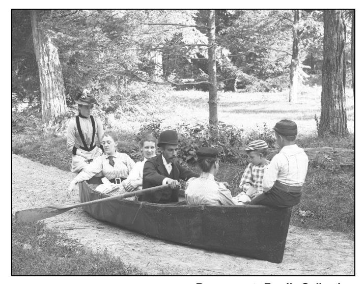
Rosencrantz Family Collection