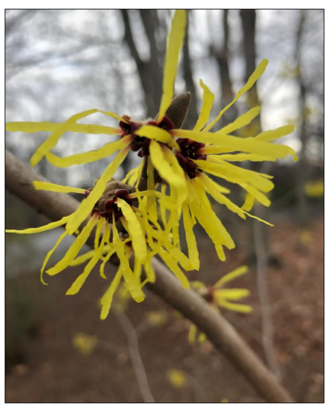
Winter offers form, color, texture: A Japanese maple (left) and witch hazel "Arnold Promise."