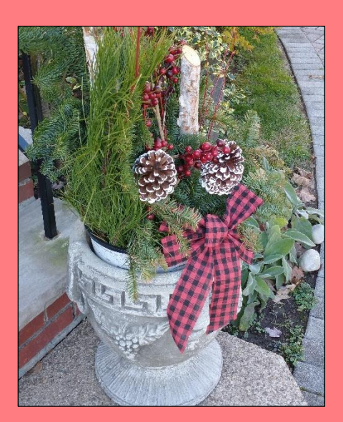
Stay safe and healthy