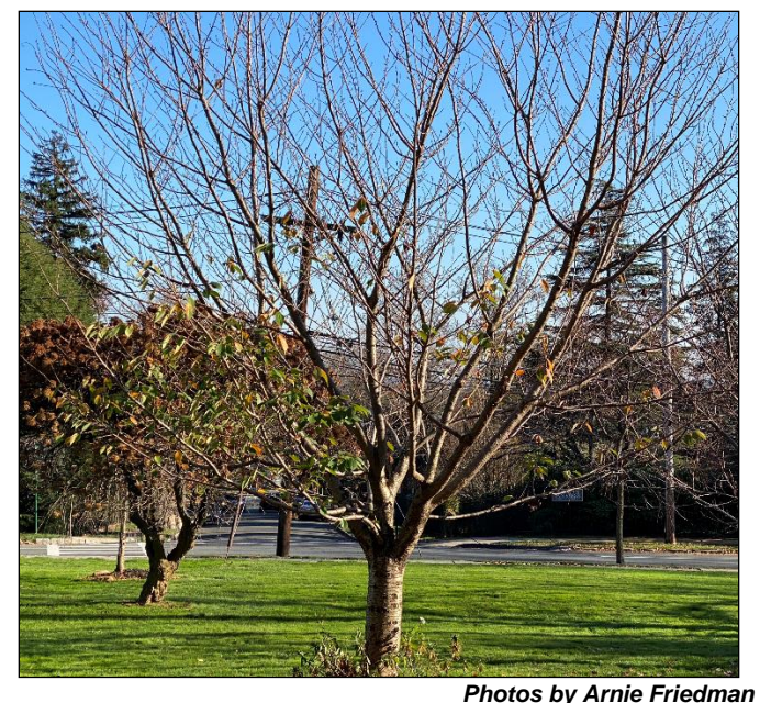
A cherry, one of eight along a driveway in Montclair, provides winter interest.

I planted this sample (below) at a house in Montclair. It is one of eight that march up a winding driveway. They are fast growers, and, with a little pruning, they have kept this tight branching pattern.