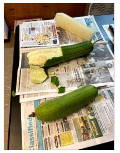
From bottom to top: The loofa fresh off the vine, the peeling process begins, the peeled and seeded loofa.

Voila! I was able to recover a couple of loofa sponges! I documented every step of this garden