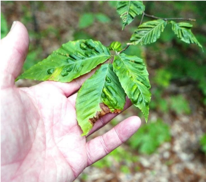
Buckeye Yard and Garden Online, Ohio State University