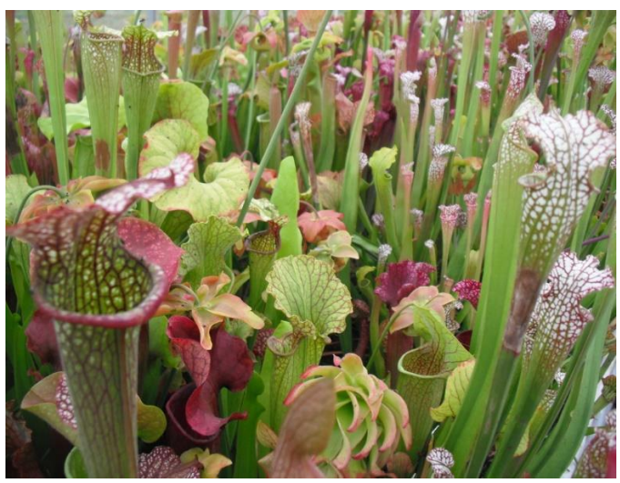
A display of pitcher plants.