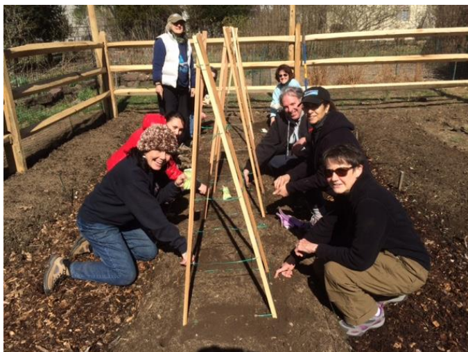
Pea Day at Garretson Farm