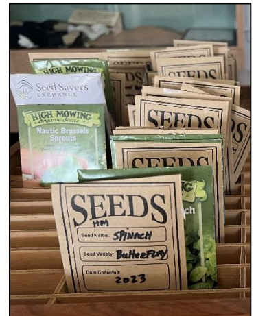
Samples of the free seeds available at Garretson Forge and Farm.