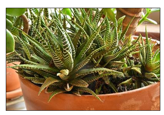
Zebra cactus (Haworthiopsis attenuata)

Haworthiopsis is a succulent that my mother propagated and distributed throughout the house and summer garden with great abandon, but it never garnered much of my attention. Having now "inherited" all of these plants, I have come to discover its beauty, along with its wonderful carefree nature. . . To read the entire article, click here.